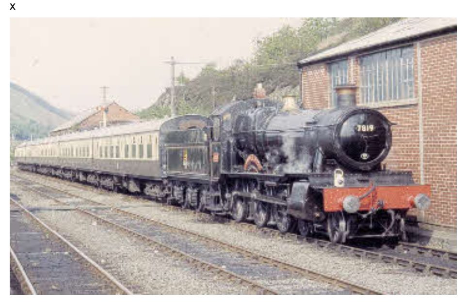
At the time of preparing this newsletter, there was no picture of the 2005 steam trains to hand. This is 7819, Hinton Manor, on the 1987 train at Machynlleth.

The latest on next year is that they are planning to do it over series of weekends up the Coast line only. There will be connections from England as the 0634 ex New St will run from December for the Saturdays and the 0830 ish ex Salop on the Sunday is available.